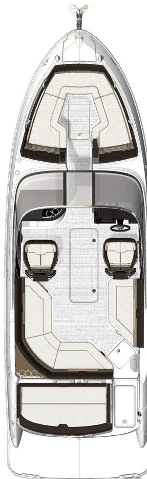
Standard Two Bucket Seats

Painted Tandem Axle Trailer w/ Bunks & Tandem Axle Disc Brakes Galvanized Tandem Axle Trailer w/ Bunks & Tandem Axle Disc Brakes Painted Tandem Axle Trailer w/ Rollers & Tandem Axle Disc Brakes Galvanized Tandem Axle Trailer w/ Rollers & Tandem Axle Disc Brakes