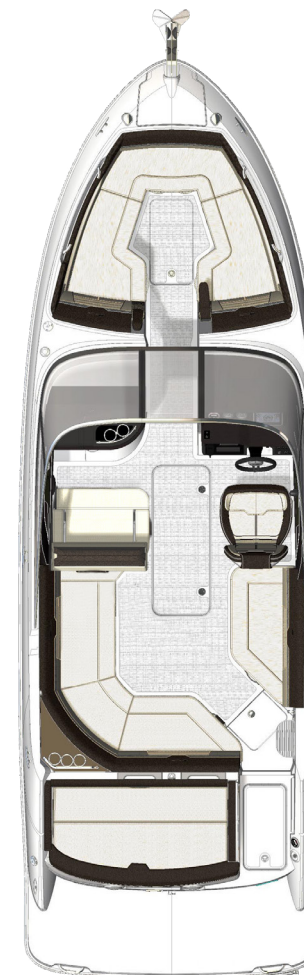
Optional Port Convertible Seat